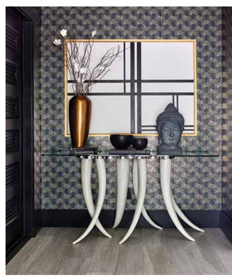
116 HOME DESIGN & DECOR CHARLOTTE | AUGUST/SEPTEMBER 2019

Create that entrance moment with special pieces; hunt for them, layer them, and use light to illuminate them ever so softly. \blacklozenge